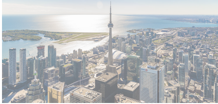
Figure 2: A View of a Nice City.